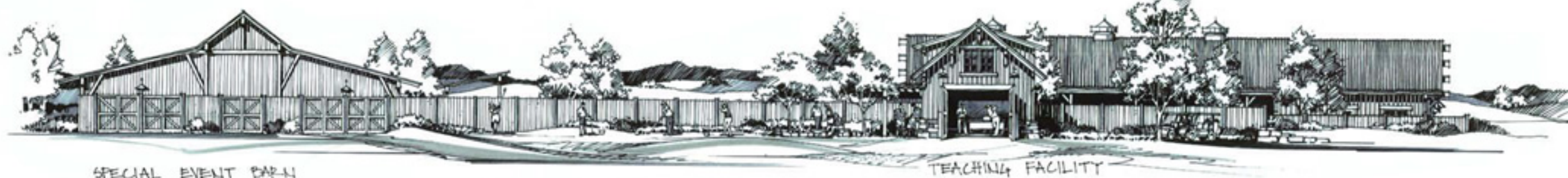
SPECIAL EVENT DRAIN